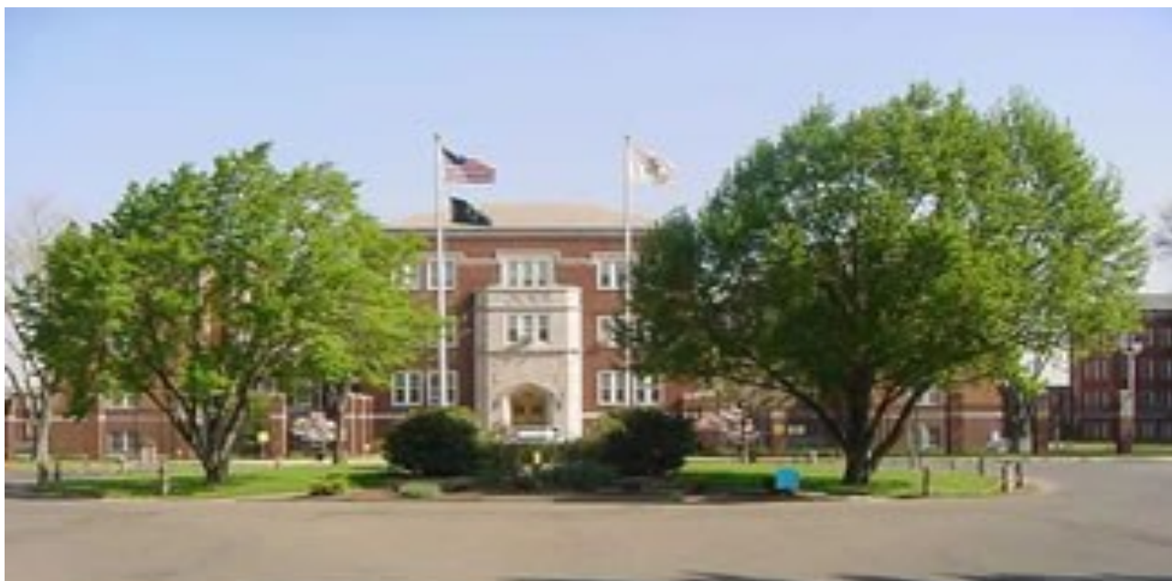
Albert C. Wagner Youth Correctional Facility